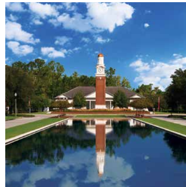
Independence - Orlando