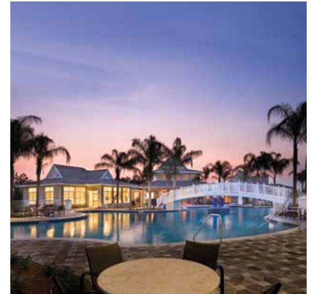
Live Oak - Tampa